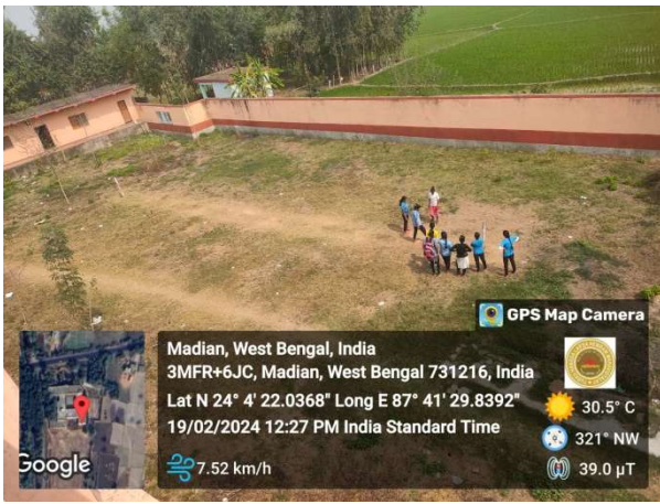
Kho Kho Ground