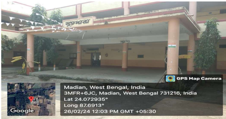
Mukta Dhara (open stage)