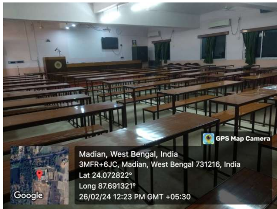
Seminar Hall (Room No 209)