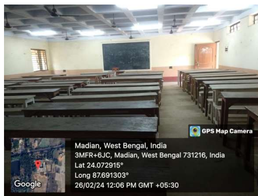
Class Room (Room No 107)