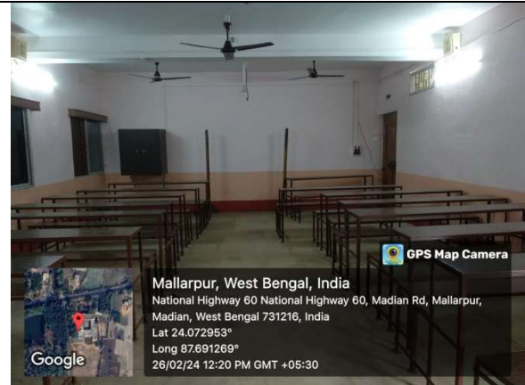
Smart Class Room-2 (Room No 208)